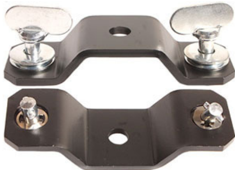
Omega Bracket (optional - not included)

powerCON TRUE1 Cable Glare Shield (2) Lens Filters